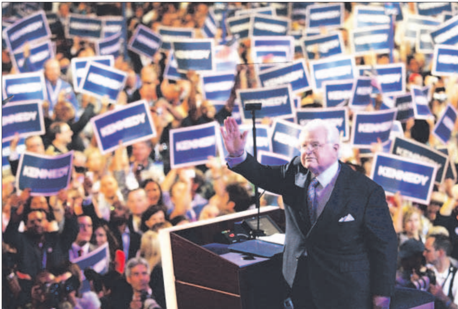
Sen. Edward Kennedy acknowledges cheers at the opening Monday of the Democratic National Convention in Denver. Speaking for about eight minutes, Kennedy, who is battling brain cancer, told delegates to set their compass "not merely victory for our party, but renewal for our nation."